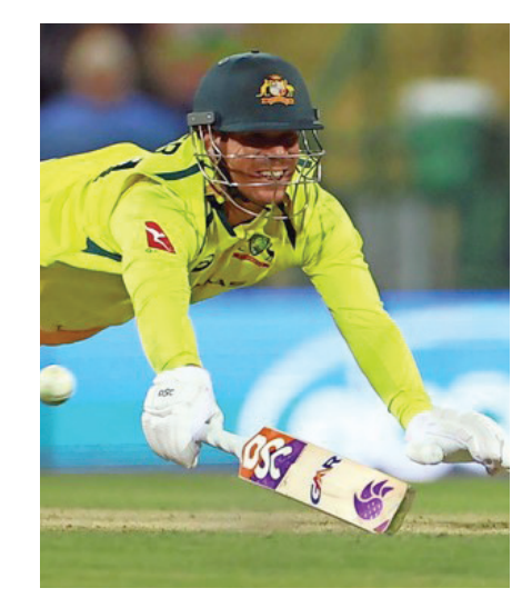
DAVID Warner.